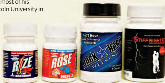
RISKY HELPERS These products contain a Viagra-like drug, the FDA said.

Hazardous ingredients have been known to turn up in dietary supplements marketed for weight loss, bodybuilding, and sexual enhancement. And in light of the potentially serious health risks—including dangerous changes in blood pressure, serious liver injury, kidney failure, heart attack, and stroke—we think consumers should be extremely cautious with those categories of products or avoid them.